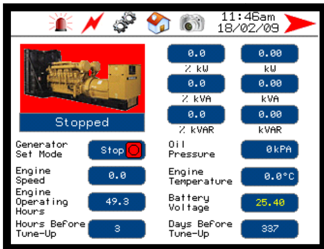
Default OVERVIEW/CONTROL screen